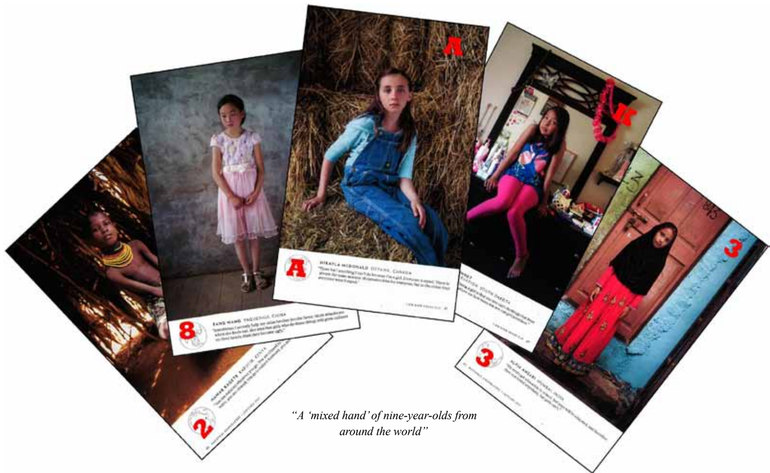
"A 'mixed hand' of nine-year-olds from around the world"