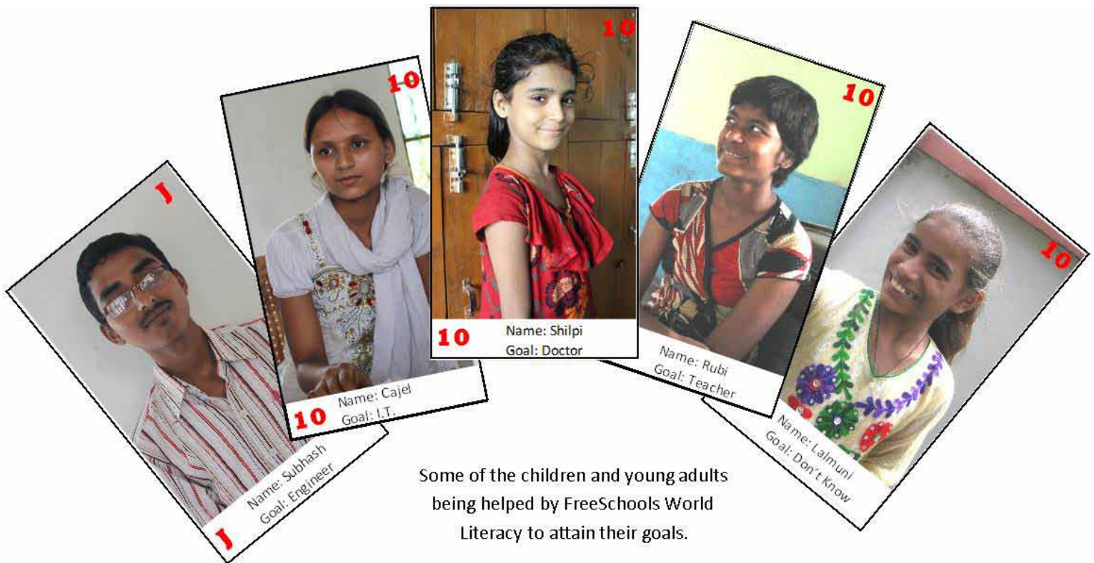
Some of the children and young adults being helped by FreeSchools World Literacy to attain their goals.

Unfortunately it is still not all aces, kings and queens for these children, but at least FreeSchools World Literacy has given them a start along their life's journey. Even if only a hand of tens – because life's problems for girls in India's rural Bihar State are always going to be hard to beat no matter what. - But perhaps these 'four of a kind' now stand a good chance of going a long way.