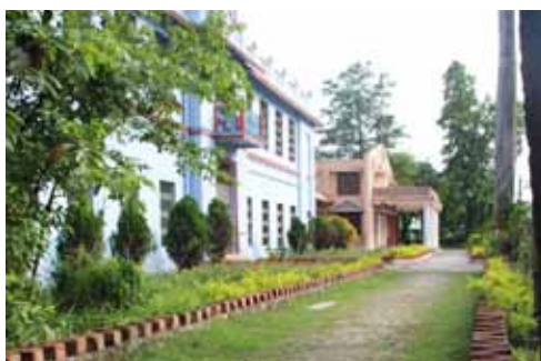
Buildings and grounds of the Sacred Hearts Convent.